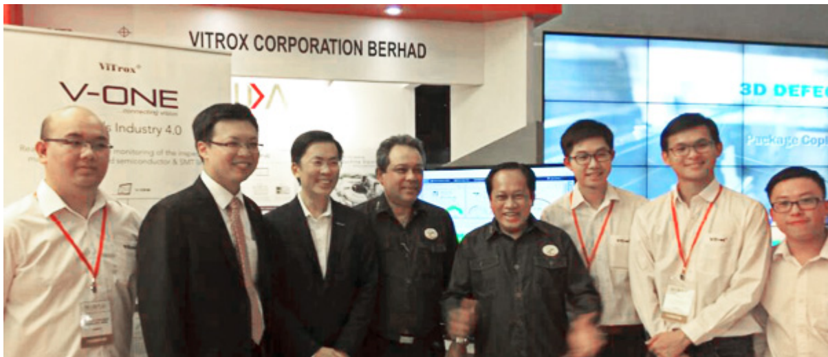
Soft Launch of V-ONE Solution during MIDA Open Day 2017